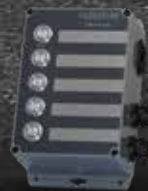
GOPAL CALL BUTTON