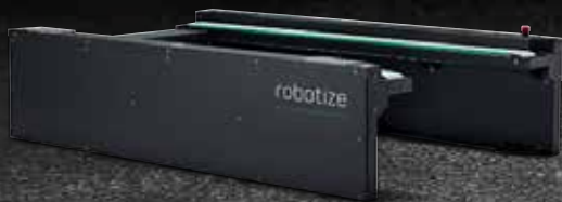
GOPAL CONVEYOR PALLET STATION

Call buttons for transport ordering can be incorporated in the solution completely independent of the pallet station.