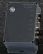
GOPAL AUX INTERFACE