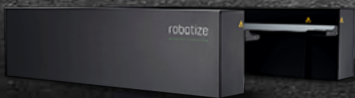
GOPAL ELEVATION PALLET STATION