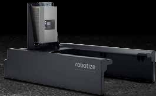
GOPAL POWER STATION