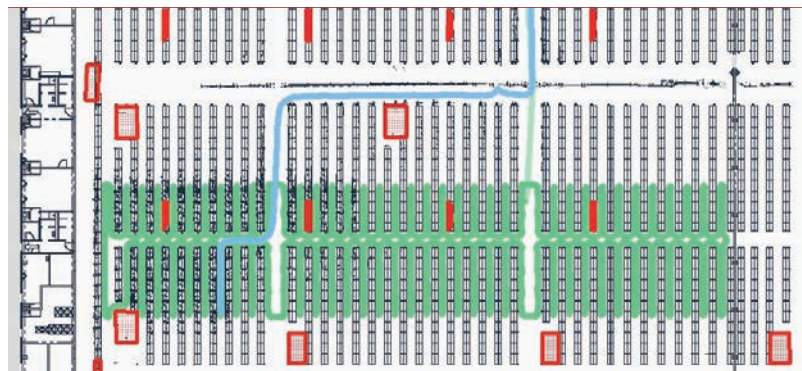
Cleaning overview in the web app