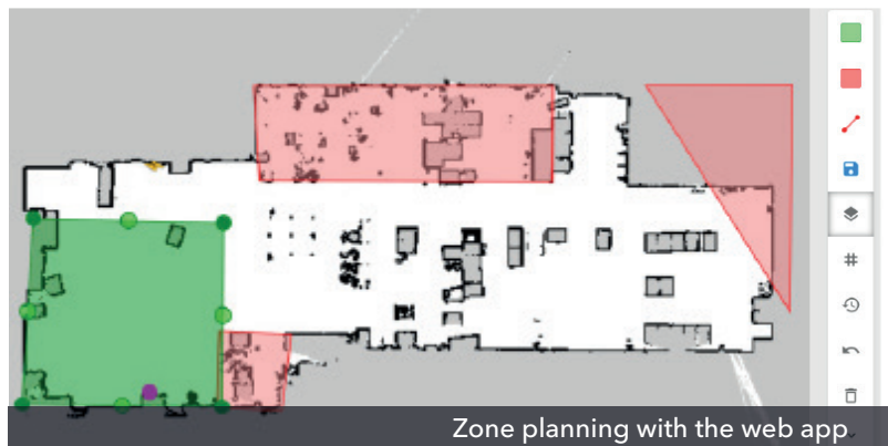
Zone planning with the web app