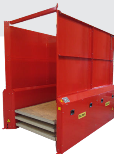
Custom-made for 2400x1200x160 mm platforms