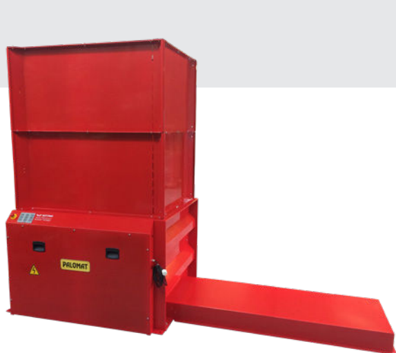
PALOMAT® with custom-made safety box