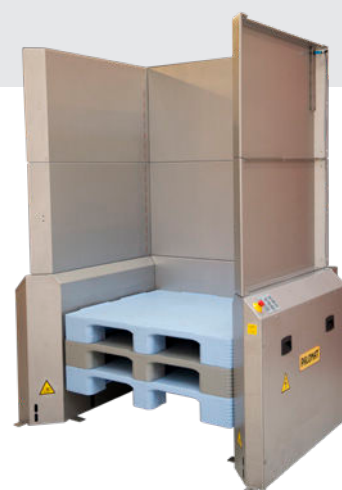
Custom-made for 1060x750x175 mm pallets